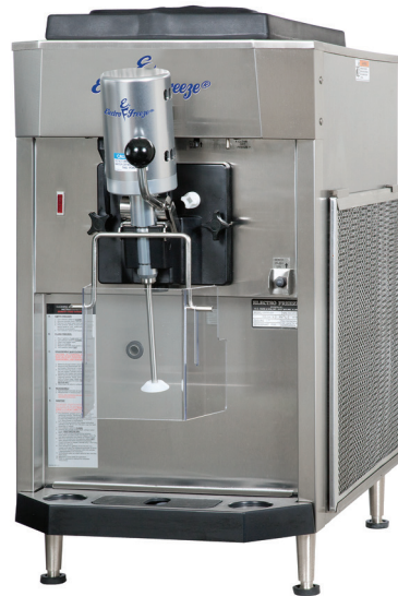
Shown with Optional Mixer and Splash Shield