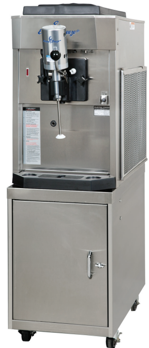
Shown with Optional Mixer and Cabinet